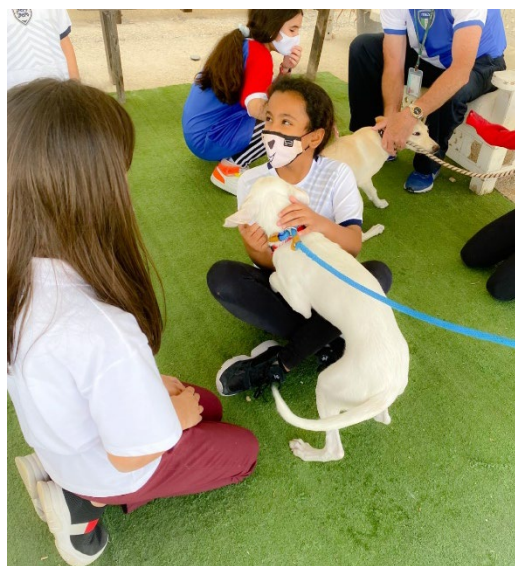
The animals at PAWS need food and attention

“All stray animals need a home and a big heart. If you would like to take action, there are many things that you could do: Donate money, food or blankets, volunteer, foster an animal, raise awareness or come to QAD and talk to us!”