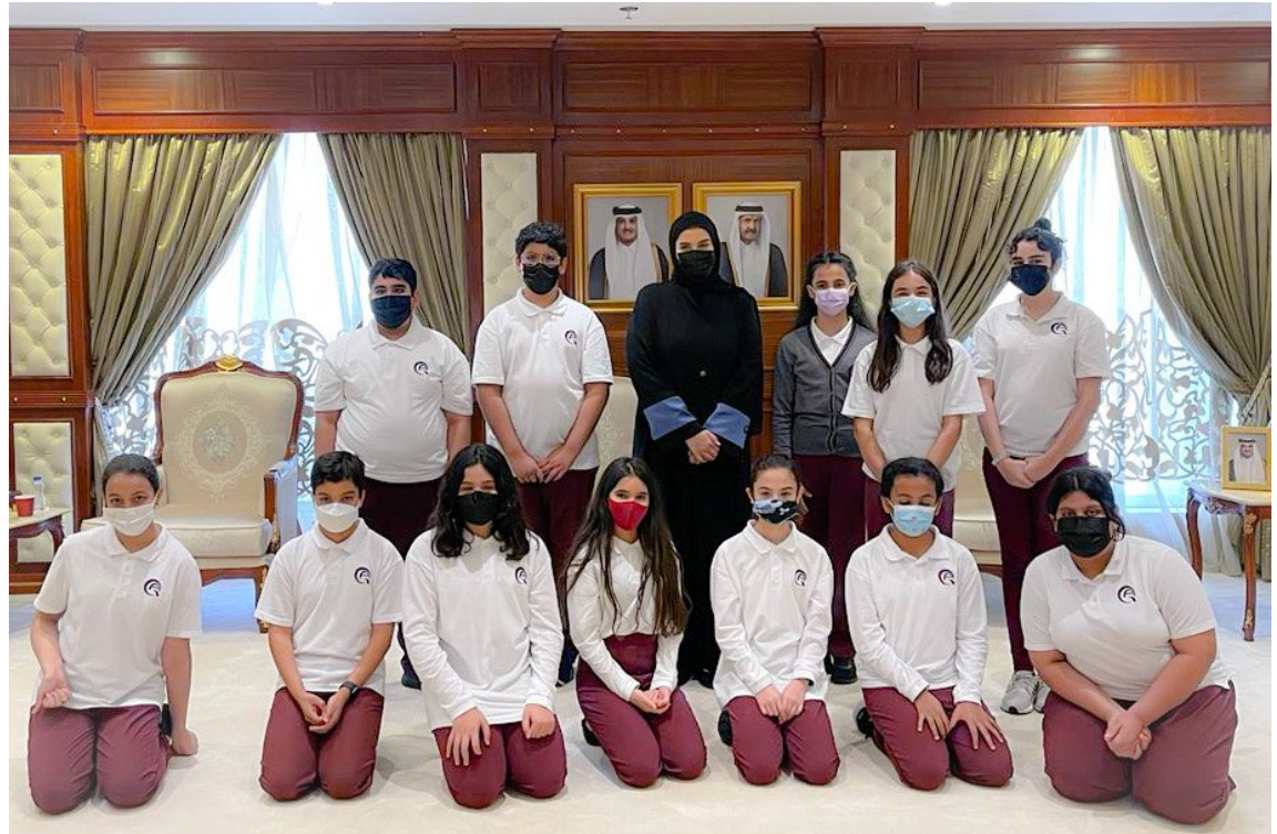
Grade 5 students met with Her Excellency Mariam bint Ali bin Nasser Al-Misnad, Qatar’s Minister of Social Development and Family

“All stray animals need a home and a big heart. If you would like to take action, there are many things that you could do: Donate money, food or blankets, volunteer, foster an animal, raise awareness or come to QAD and talk to us!”