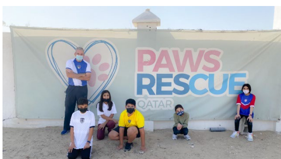
Grade 5 students are supporting PAWS Rescue