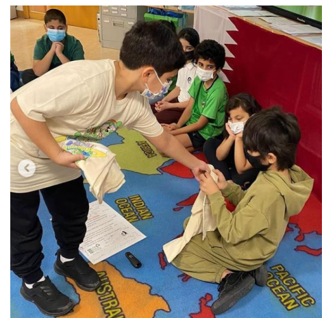
Grade 5 sharing sustainable T-shirts

Grade 5 students also designed face-masks and then gave them away to Grade 1 - so kind!